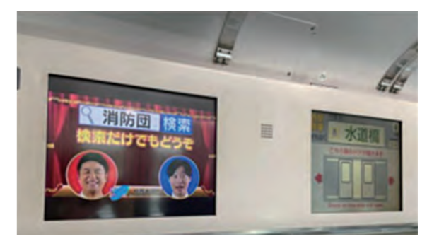
In-train monitor ads 電車内モニター広告