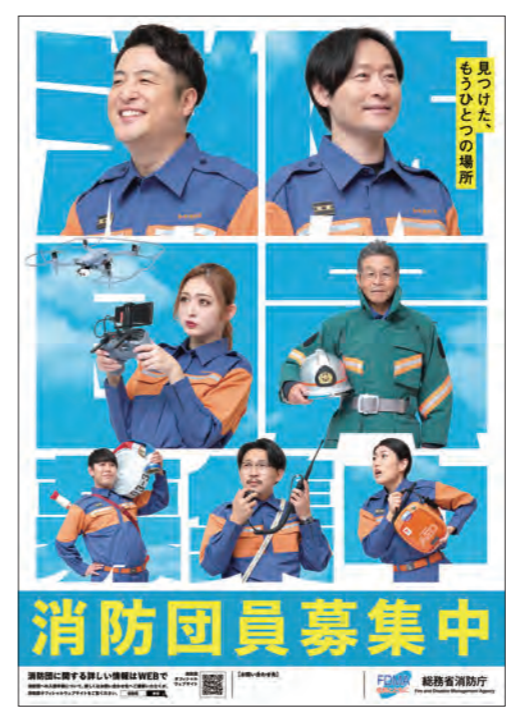
Volunteer Fire Corps participation promotion via publicity posters ポスター等による消防団加入促進

に消防団活動に取り組み、地域社会へ多大なる貢献をした大学生等に対して実績を認定する「学生消防団活動認証制度」の普及・啓発、③消防団活動に協力的な事業所を顕彰する「消防団協力事業所表示制度」の普及・啓発、④消防団員募集ポスター等の配布やイベントの開催を通じた消防団への加入促進、⑤女性や若者の加入を促進するための地方公共団体の工夫を凝らした取組の支援、⑥救助用資機材等の消防団の装備の充実などに取組んでいます。