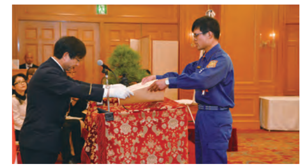
Presentation of the award to a model Volunteer Fire Corp for its activities. 他の模範となる活動を行った消防団への表彰